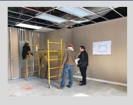
AWL General Contracting and Long & McQuade working hard to bring this room to life!