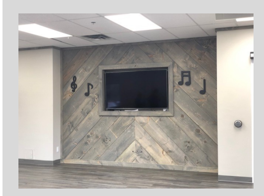
The Feature Wall: Donated by AWL. Thank you for your making our dreams a reality!

Community Living Burlington is excited to announce that we have surpassed our goal of $100,000 to renovate our existing space and create the *new* Moments through Music room. We extend our sincere gratitude to all of our donors and most prominently, our private donor who matched every donation we received. You have truly made our dream of bringing music into the lives of everyone we support, a reality.